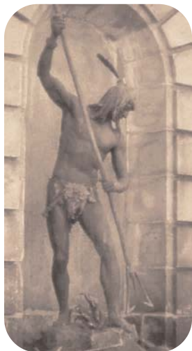
LA GROUPE DES ABENAQUIS "LE PECHEUR A LA NIGOGUE"