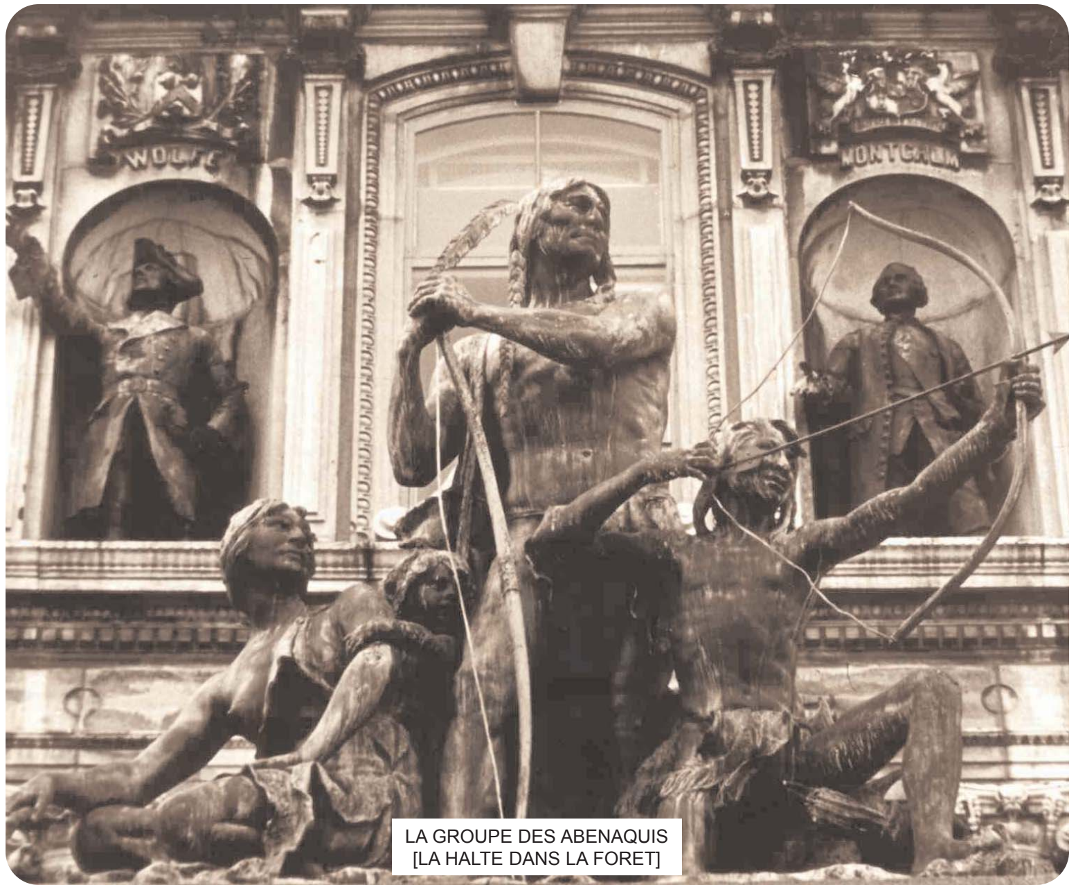
LA GROUPE DES ABENAQUIS [LA HALTE DANS LA FORET]

produce ten statues for the Parliament (now the National Assembly) building in Quebec City. The commission called for a payment of $10,000 for the creation of the statues and a further subsidy for him to study in France. This marks the time that a Canadian artist is accorded the honour of receiving such a grant to study abroad.